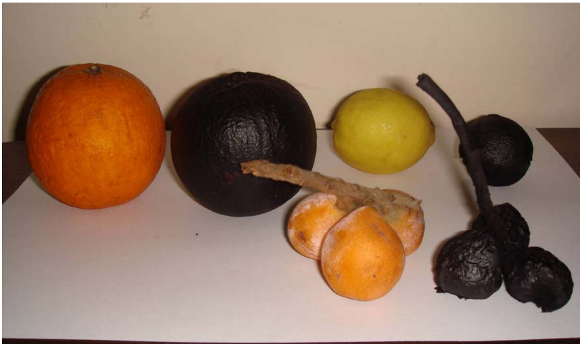
Fruits charcoals; orange, lemon, loquat