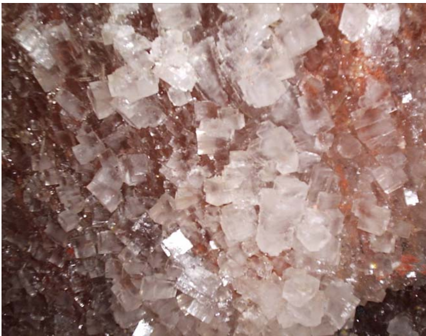
sodium chloride cubic crystals on the wall of the salt mine

The salt (sodium chloride) makes a cubic crystal. However, it takes several months to make a big crystal in the laboratory. There is salt mine in the Salt Range. The cubic crystals of the salt sticking on the wall can be seen in the mine.